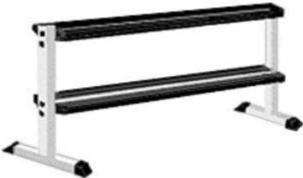
Dumbbells: 5-50 lbs.